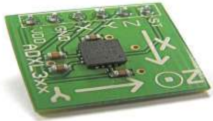
Figure 2. MEMS Sensor

and over the set threshold and then fall is detected and send the message to a caretaker.