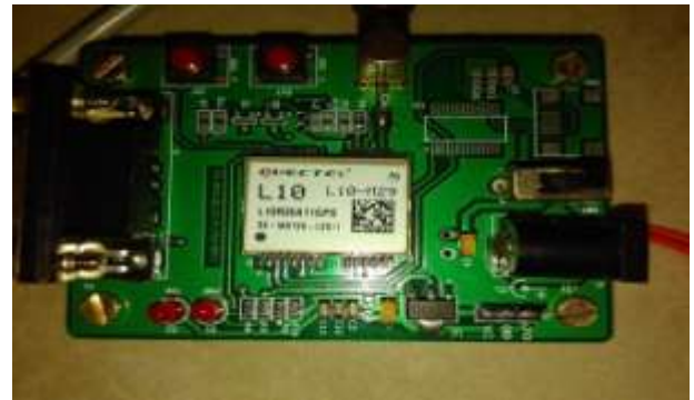
Figure 5. GPS module

This system used GPS module L10 brings the high performance of the MTK positioning engine to the industrial model. The L10 supports 210 PRN channels. With 66 search channels and 22 concurrent tracking channels, it acquires and tracks satellites in the smallest time even at indoor signal level. This ready, stand-alone receiver combines an expanded array of features with adjustable connectivity options. Their ease of integration results in fast time-to-market in a wide range of automotive, consumer and industrial applications.