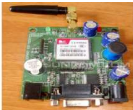
Figure 4. GSM module

A GSM modem used in this system is a wireless modem that works with a GSM wireless network. GSM modem is used in this system for sending a message to the particular mobile number. A wireless modem functions like a dial-up modem. GSM modem requires a SIM card from a wireless express in order to operate. As mentioned in earlier sections of this SMS tutorial, computers use AT commands to control modems. Both GSM modems and dial-up modems continue a common set of standard AT commands.